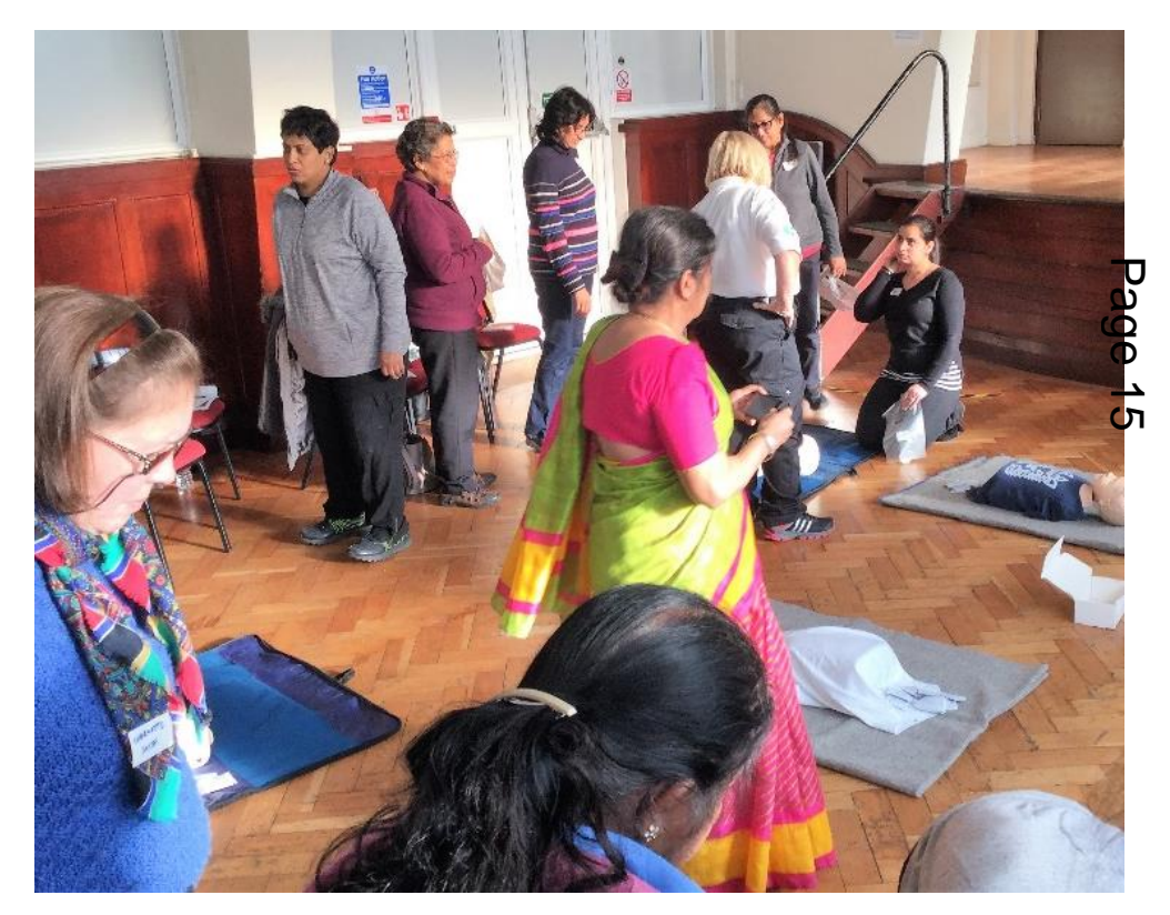
Tamil first aid course - Richmond

Our Patient and Public Engagement Steering Group advises us on all communications and engagement